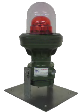
EVde with special mounting plate