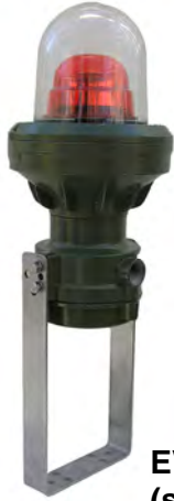
EVde with U-bracket (standard)

LONG LIFE (up to 100,000 hours) 5 year warranty